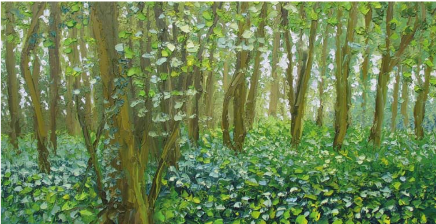
Taking Shelter from the Summer Rain in the Woods Oil on canvas 66 x 127 cm