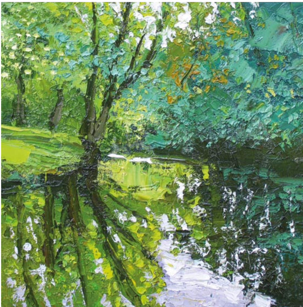
Silent River Oil on canvas 61 x 61 cm