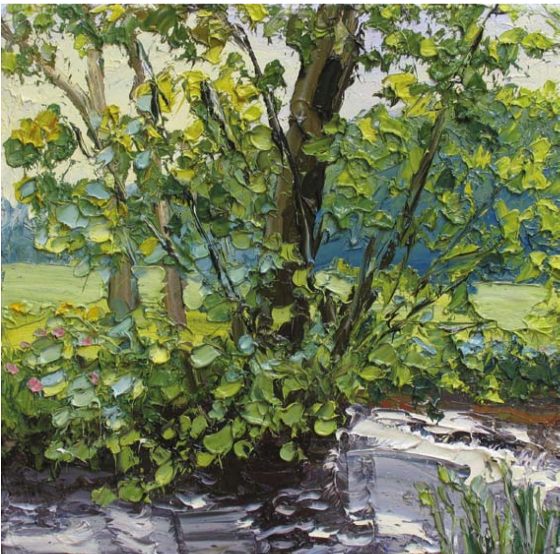
Spring Oil on canvas 51 x 51 cm