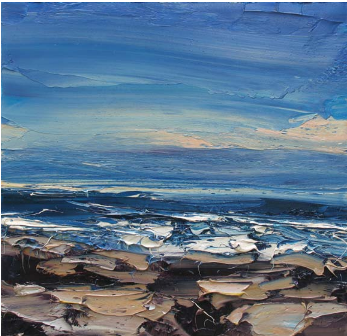
Coast Oil on canvas 41 x 41 cm