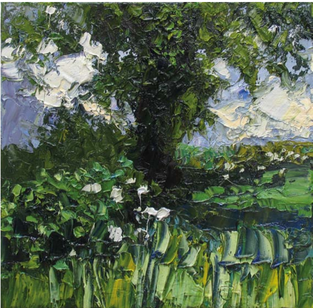
Summer Lane Study Oil on canvas 41 x 41 cm