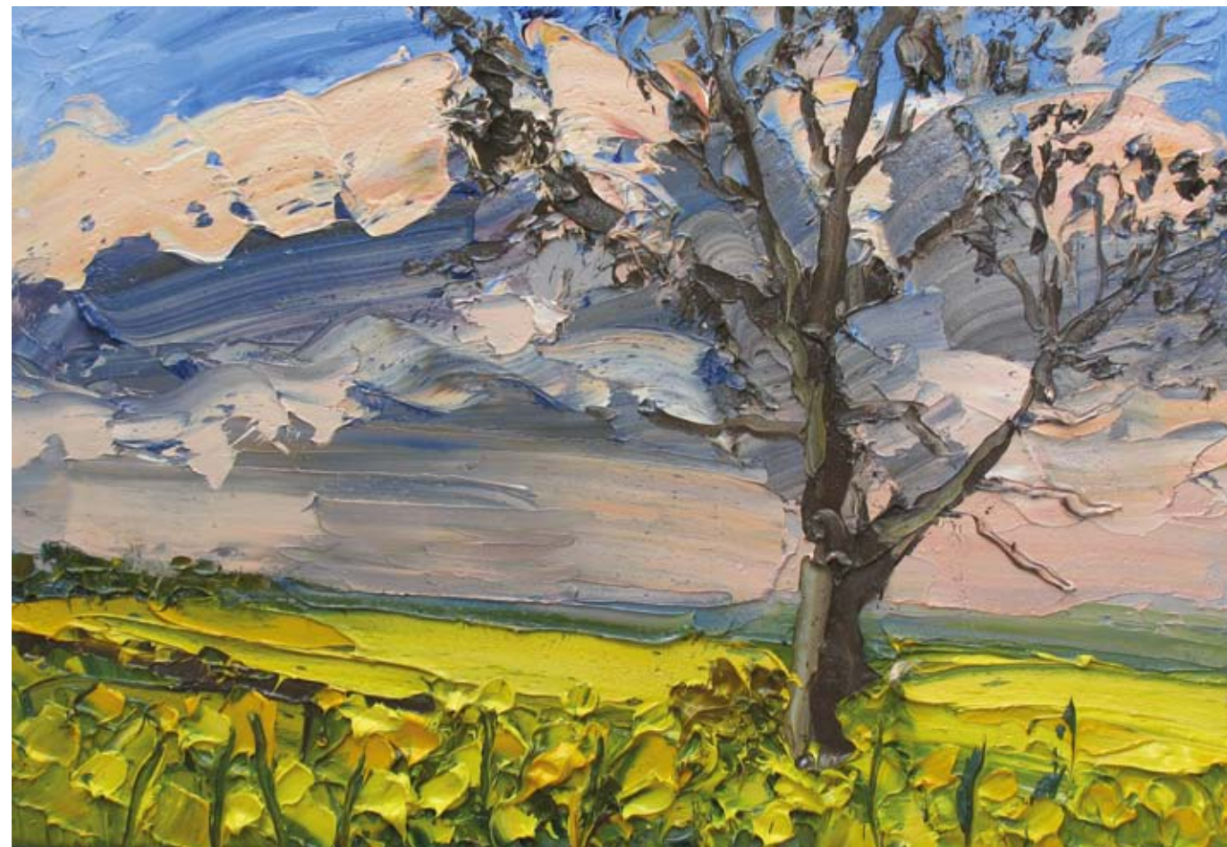
Rapeseed Oil on canvas 46 x 66 cm