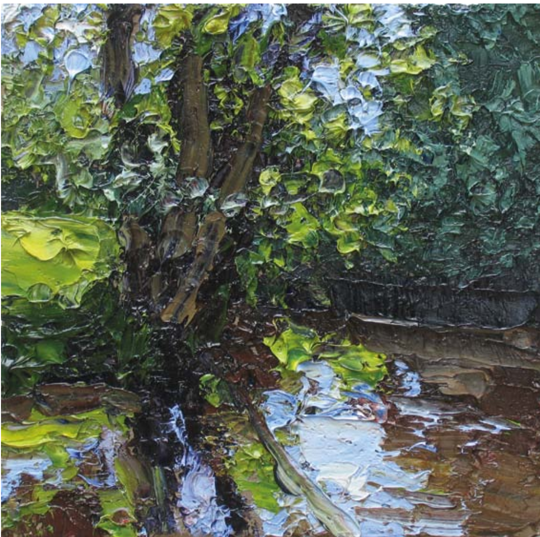
Summer River Study Oil on canvas 31 x 31 cm