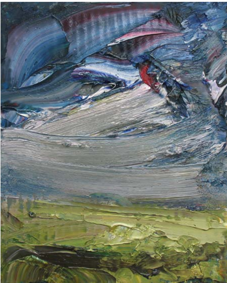
Strong Winds Oil on board 30 x 25 cm