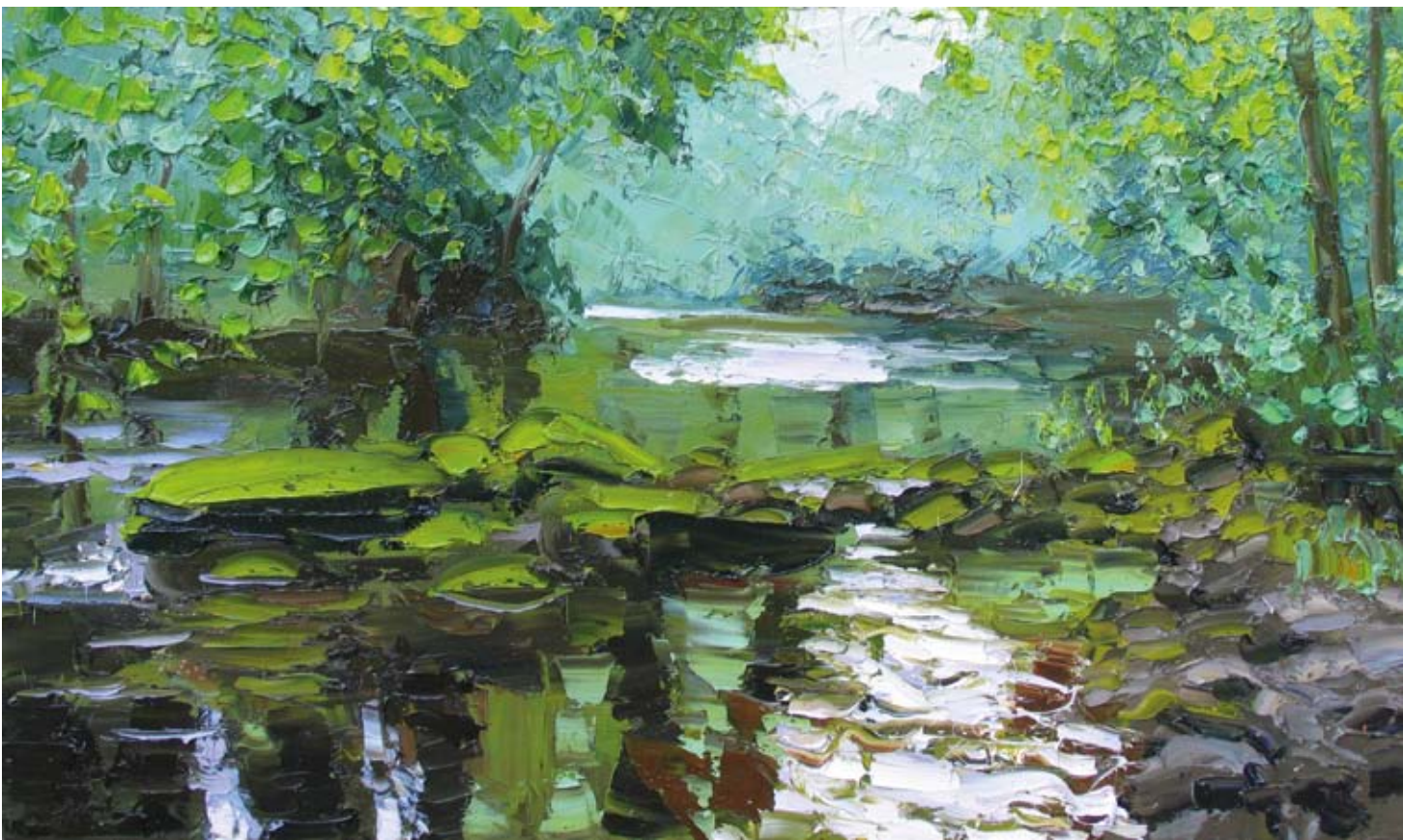
Runs through the Land Oil on canvas 166 x 112 cm