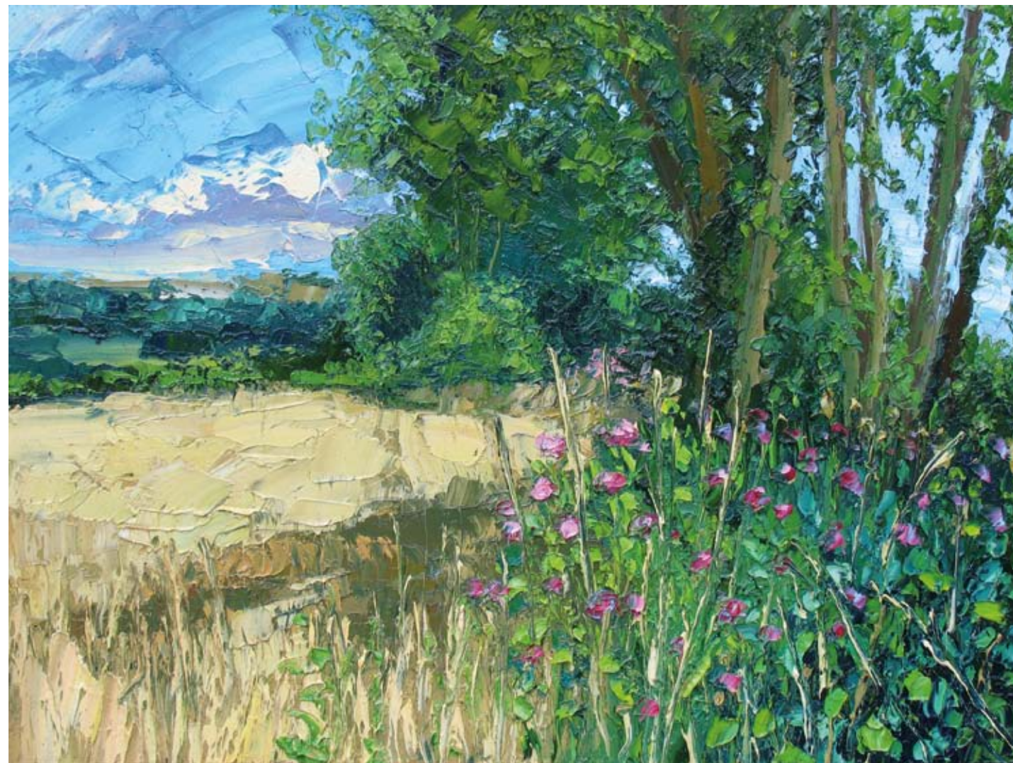
Cornfield Oil on canvas 112 x 127 cm