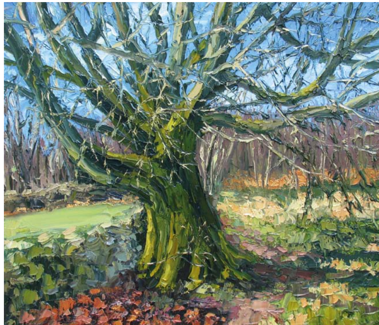
Ancient Oak Oil on canvas 92 x 108 cm