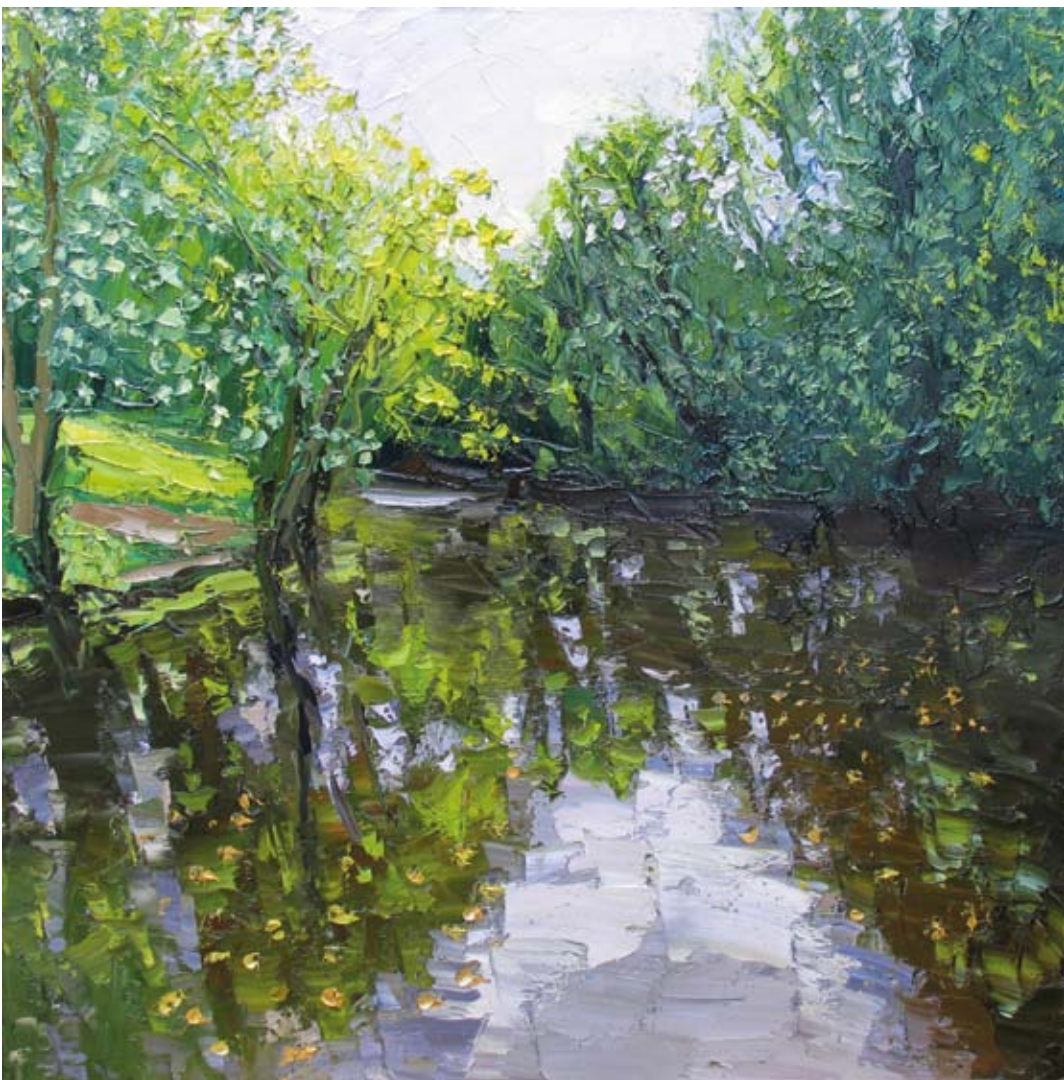
Deep Waters Oil on canvas 102 x 102 cm