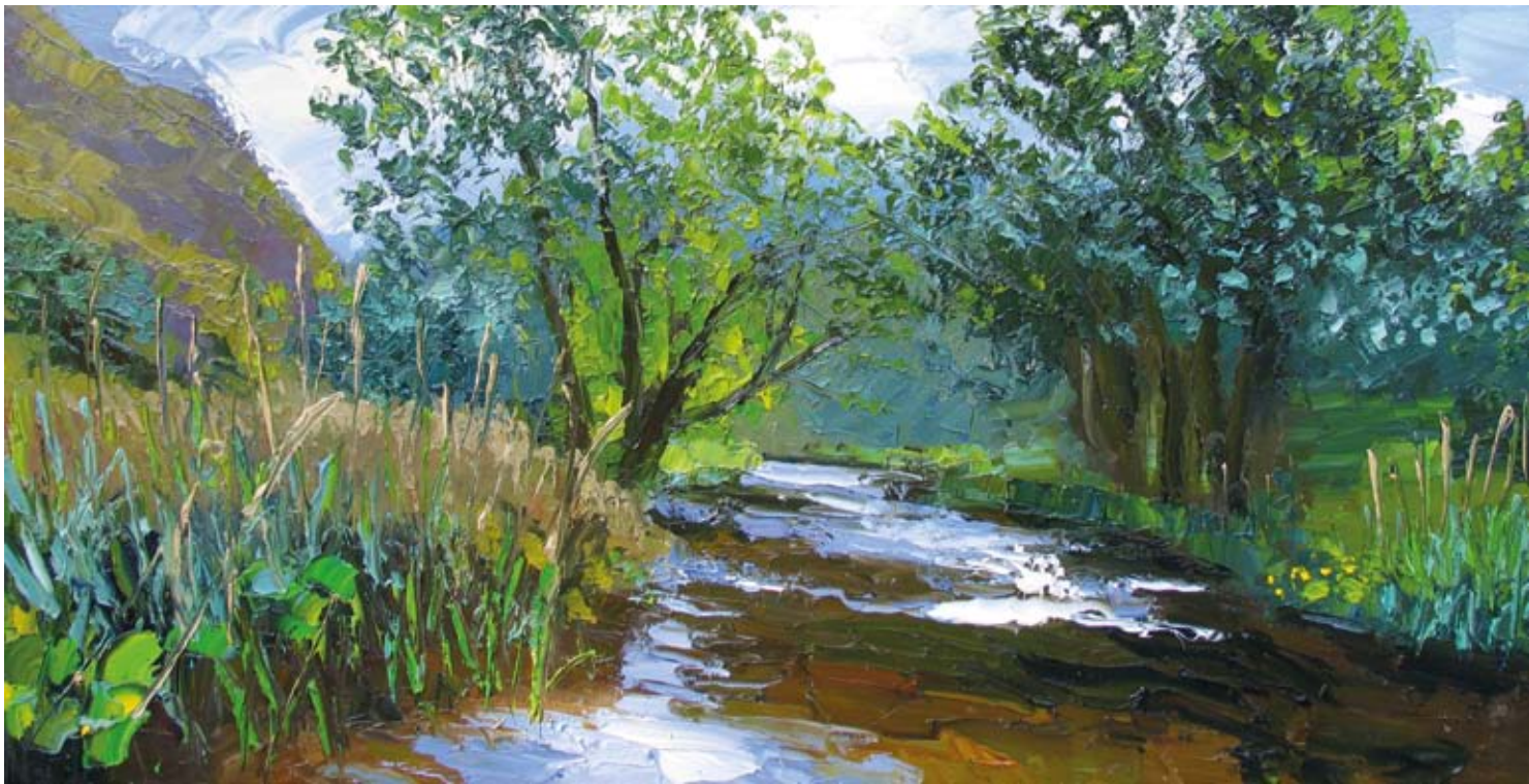
Dovedale Oil on canvas 66 x 127 cm