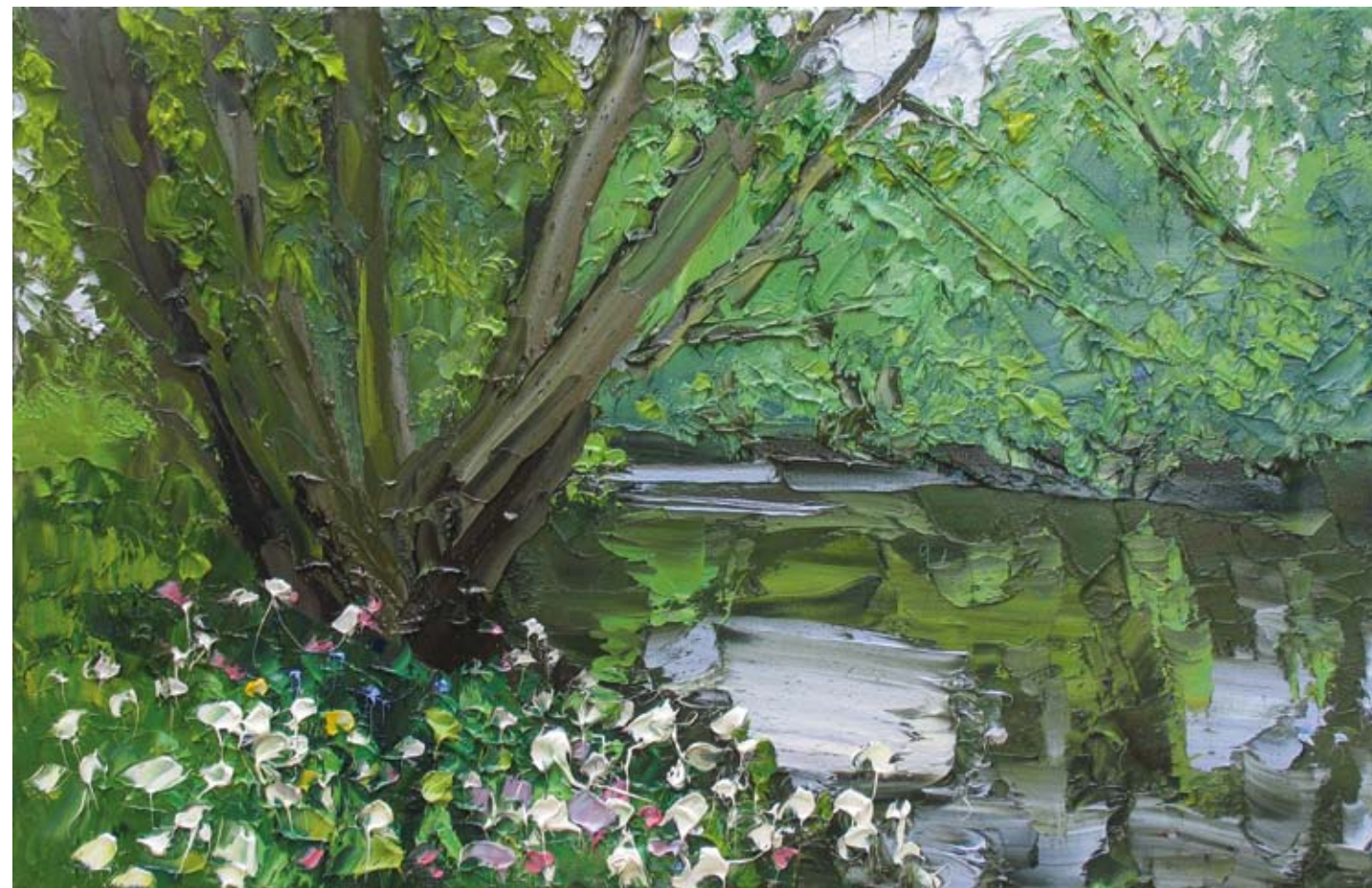
Wild Flowers Riverbank Oil on canvas 43 x 66 cm