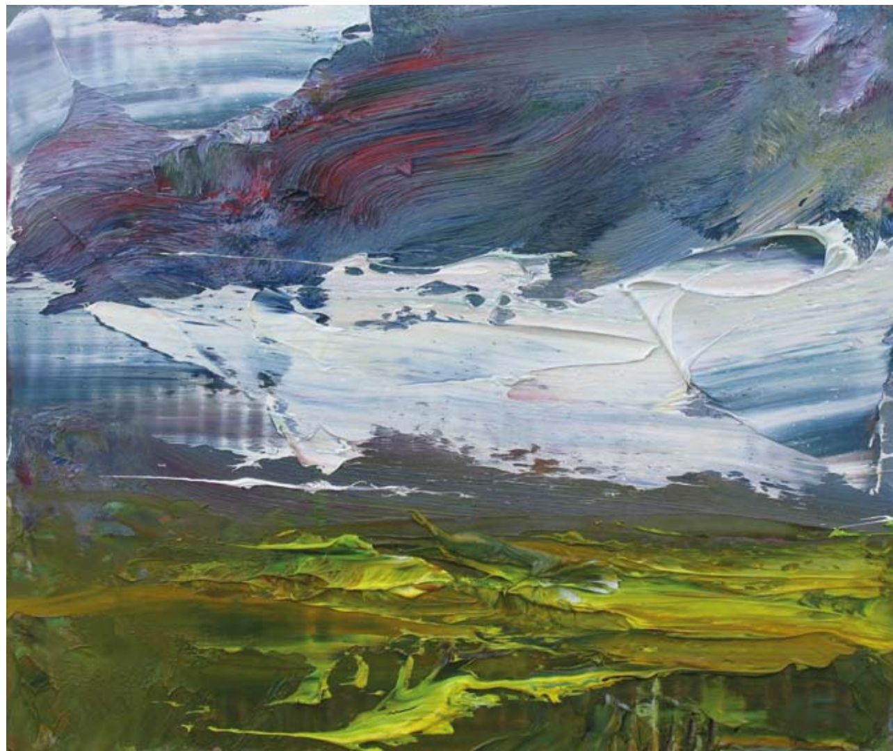
Winter Light Oil on board 24 x 28 cm