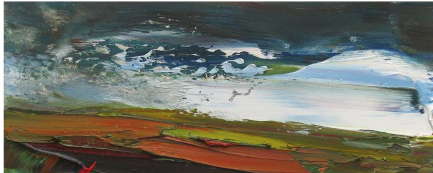
Passing Oil on board 14 x 36 cm