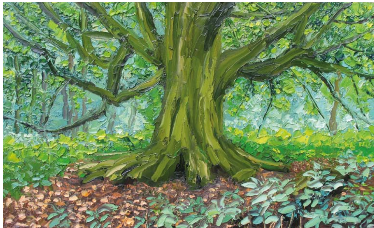
Old Beech Tree Oil on canvas 55 x 93 cm