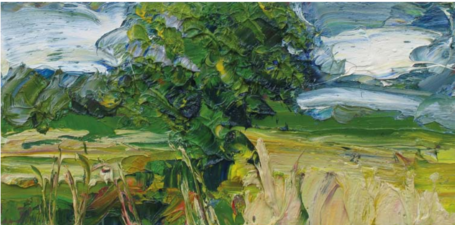
Cornfield Study Oil on board 30 x 25 cm