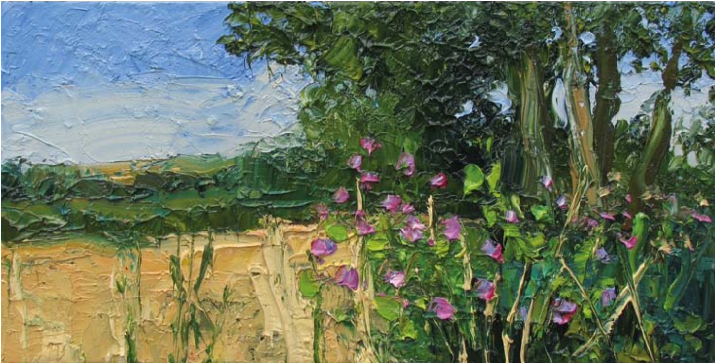
Cornfield & Willowherb Oil on canvas 30 x 60 cm