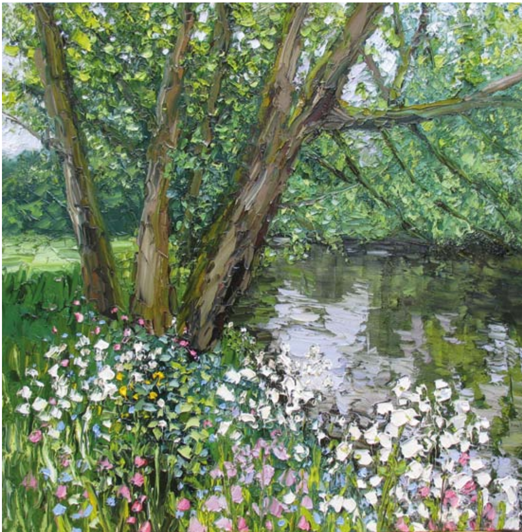
Spring Riverbank Oil on canvas 102 x 102 cm