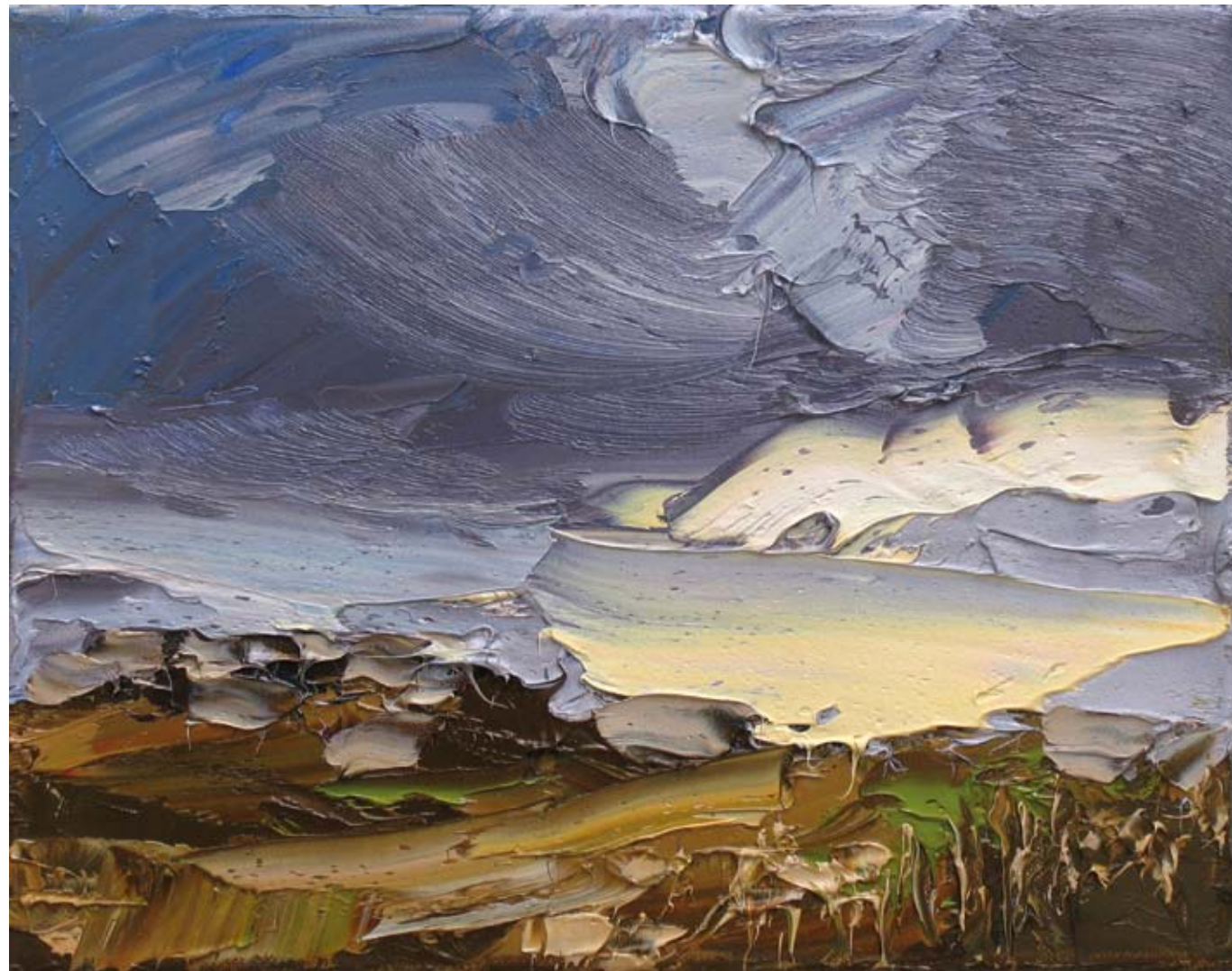
Stormy Skies Oil on canvas 24 x 30 cm