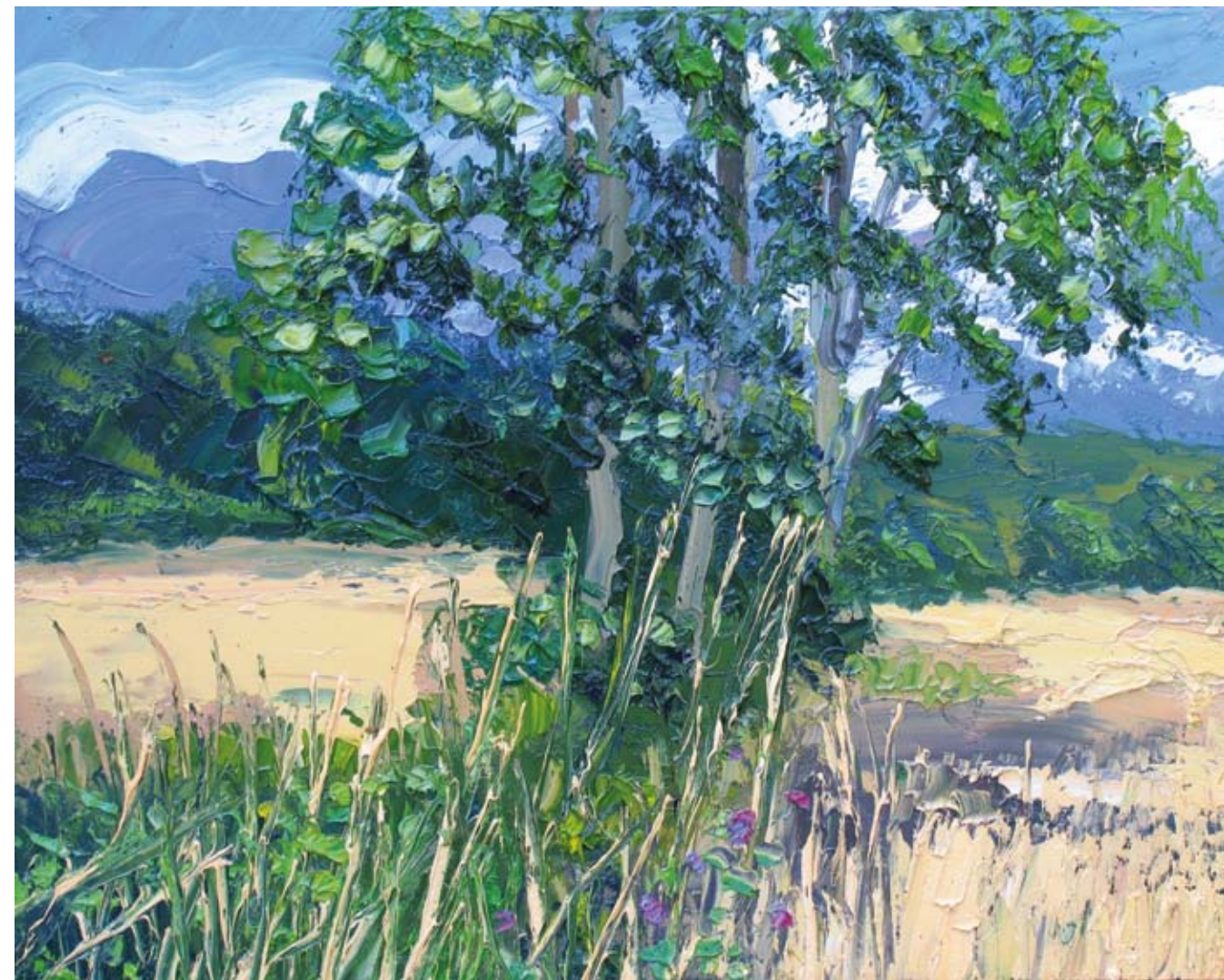
Cornfield Oil on canvas 61 x 76 cm