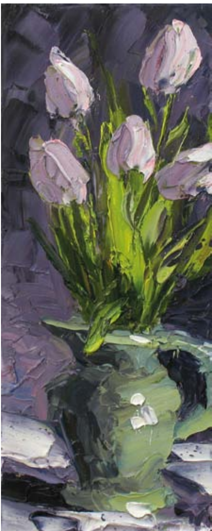
Tulips in a Jug Oil on canvas 51 x 21 cm