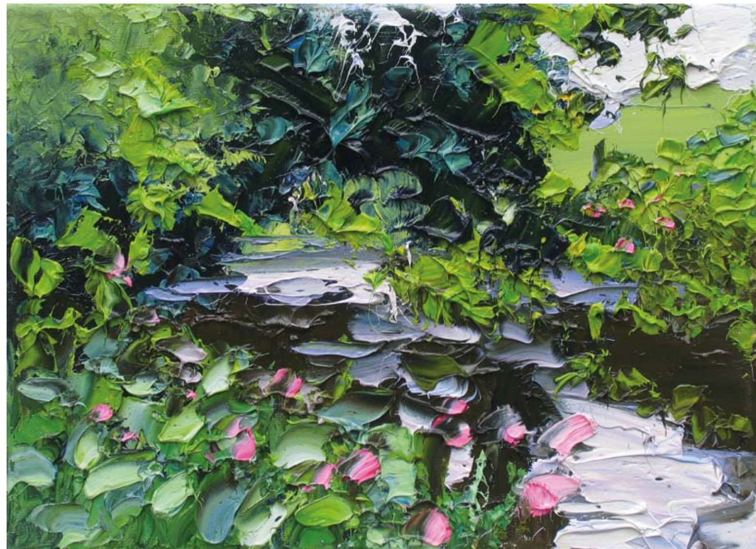
Hidden Streams & Wild Flowers Oil on canvas 23 x 31 cm