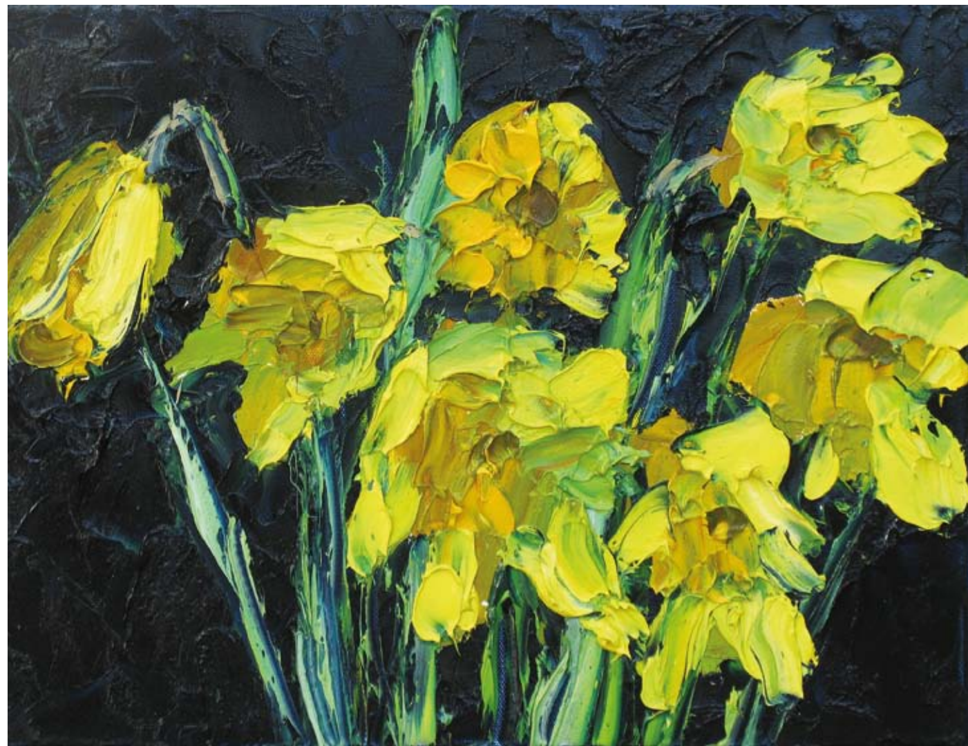
Daffs Oil on canvas 30 x 40 cm