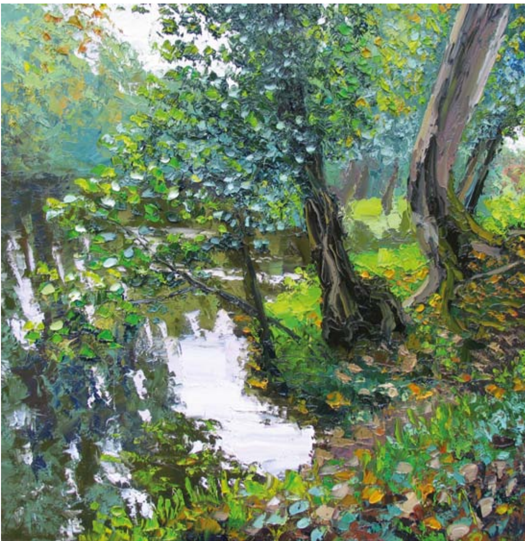
River's Edge Oil on canvas 102 x 102 cm