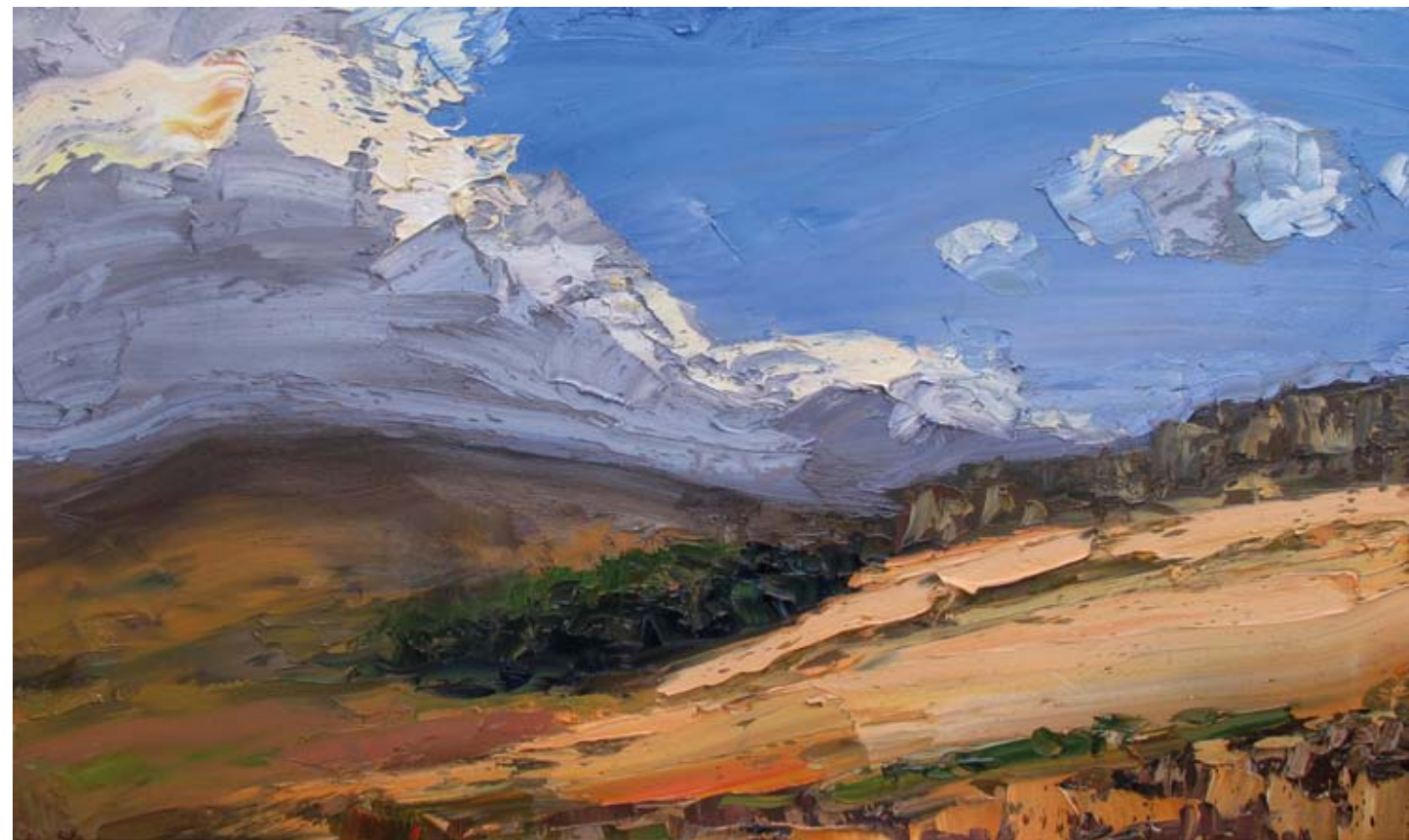
Winter Upland Oil on canvas 55 x 93 cm