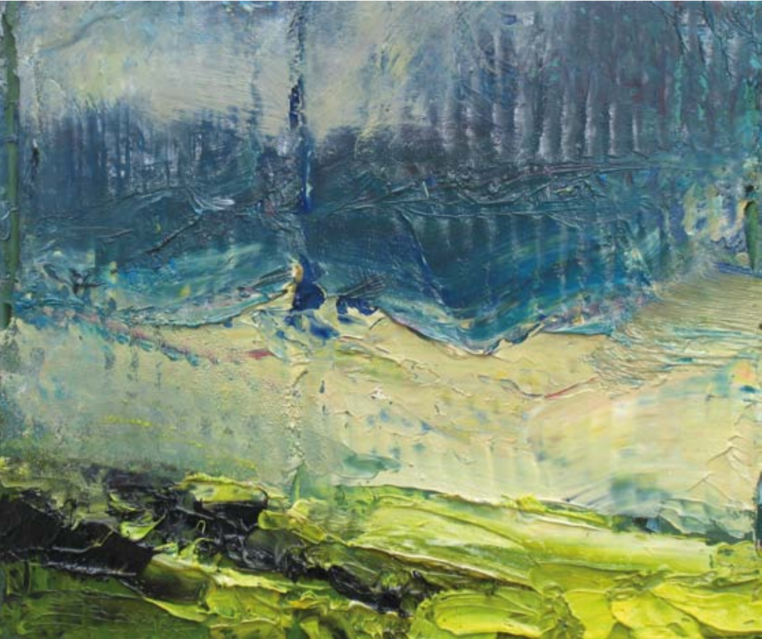
Spirals brings Rain & New Growth Oil on board 19 x 27 cm