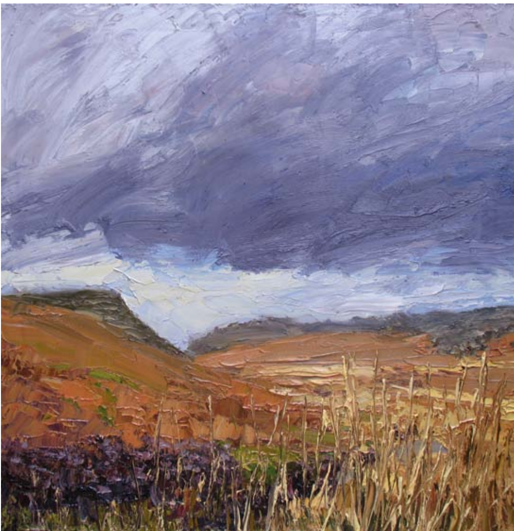
Spring Storms Oil on canvas 112 x 112 cm