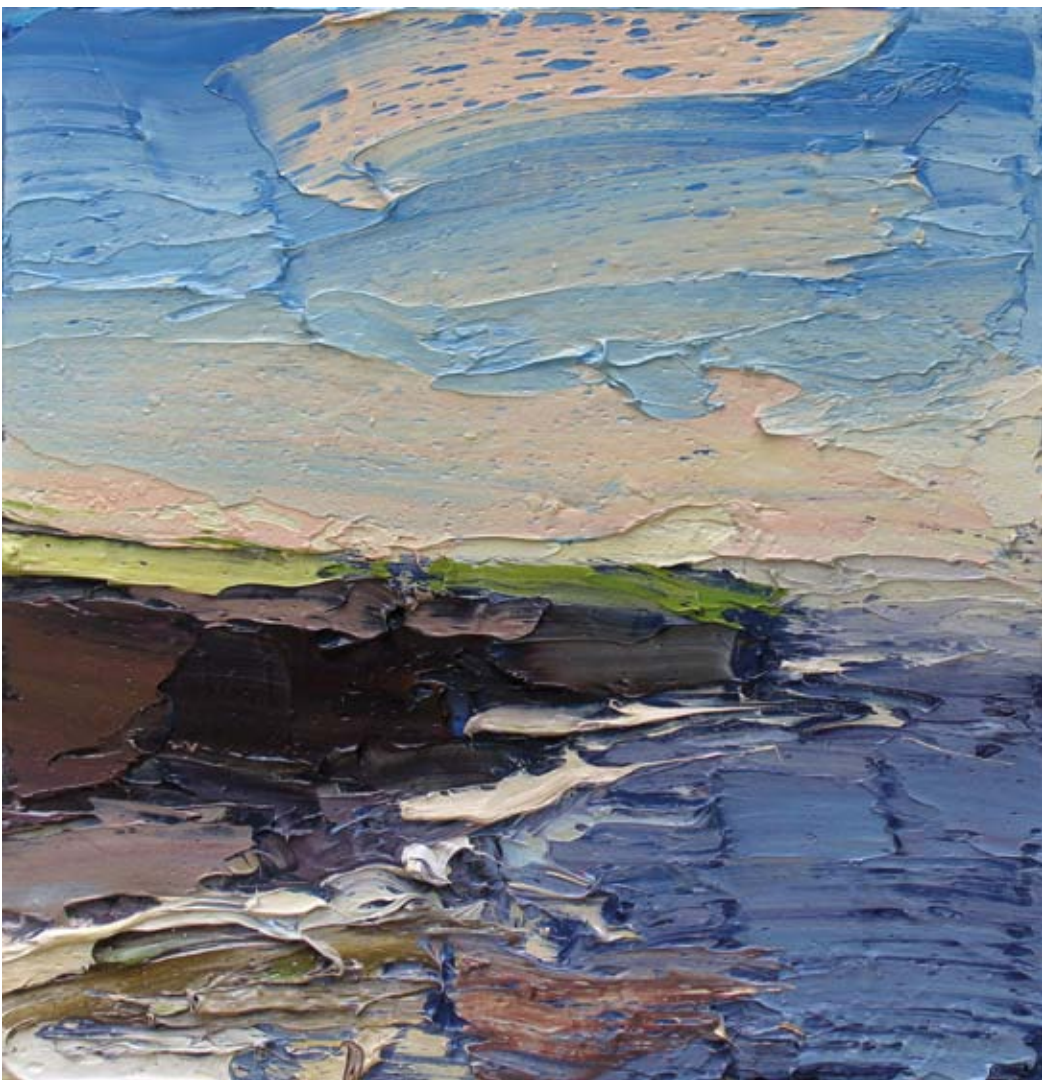
Witches Point Oil on canvas 31 x 31 cm