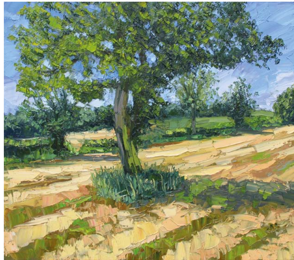
Harvest Oil on canvas 112 x 127 cm