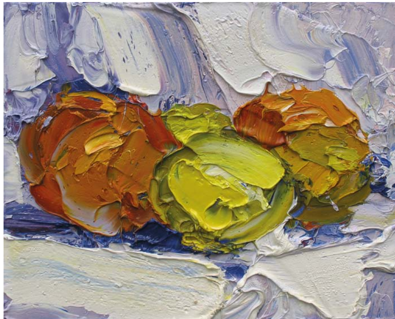
Oranges & Lemons Oil on canvas 26 x 31 cm